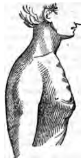
WILLIAM HENRY POWELL.